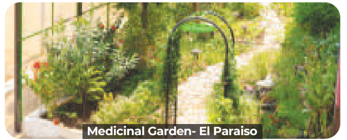
Medicinal Garden- El Paraiso