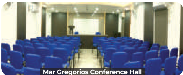
Mar Gregorios Conference Hall