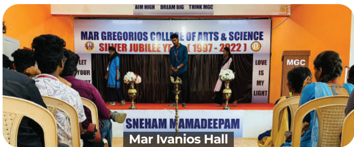
SNEHAM MAMADEEPAM Mar Ivanios Hall