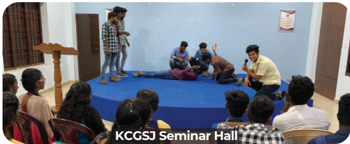
KCGSJ Seminar Hall