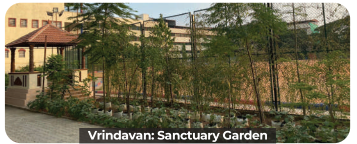
Vrindavan: Sanctuary Garden