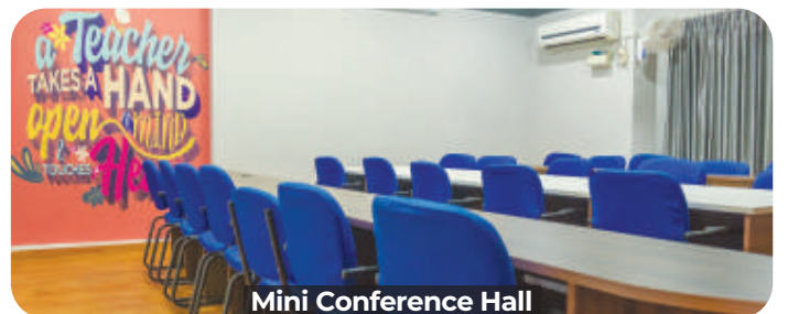
Mini Conference Hall