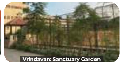
Vrindavan: Sanctuary Garden