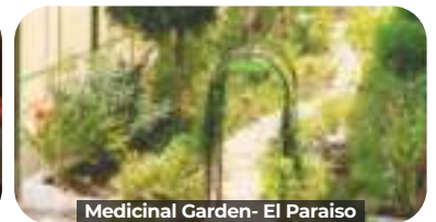
Medicinal Garden- El Paraiso