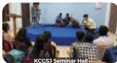
KCGSJ Seminar Hall