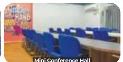
Mini Conference Hall