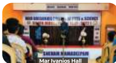
Mar Ivanios Hall