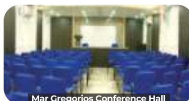
Mar Gregorios Conference Hall